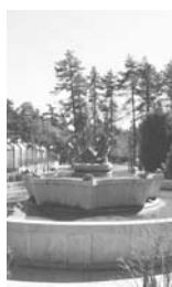
22. Potenza Fountain, Monteleale Park