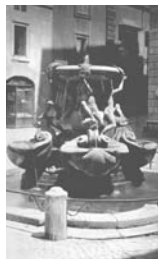
2. Roma Fontana delle Tartarughe, Piazza Mattei