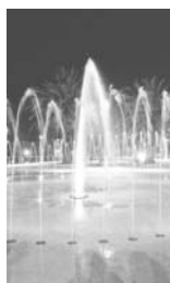
16. Cagliari Fontana della passeggiata, Via Roma