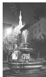
11. Milano Fountain, Piazza Fontana