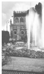
4. Venezia Fountain, Excelsior Palace Hotel