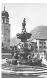
21. Trento Fontana di Nettuno, Piazza del Duomo