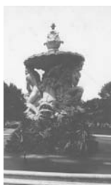
9. Napoli Fountain, Capodimonte Gardens