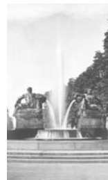
6. Torino Fontana angelica delle Quattro Stagioni, Piazza Solferino