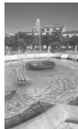
5. Campobasso Fountain, Piazza Vittorio Emanuele