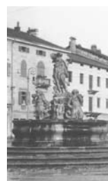
24. Gorizia Fountain, Piazza della Vittoria