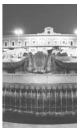
15. Bari Fountain, Piazza Aldo Moro