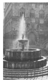
12. Perugia Fontana Maggiore, Piazza IV Novembre