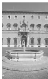
8. Forlì Fountain, Piazza Ordellaffi