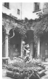
13. Palermo Fontana del Tritone, Archaeological Museum