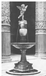
3. Firenze Courtyard fountain, Palazzo Vecchio