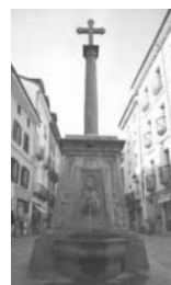
18. Aosta Fountain, Via Croce di Città