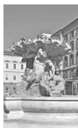
19. Trieste Fontana dei Tritoni, Piazza Vittorio Veneto