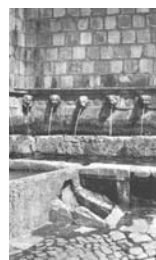
17. L'Aquila Detail of the Fontana delle 99 Cannelle, Piazza San Vito