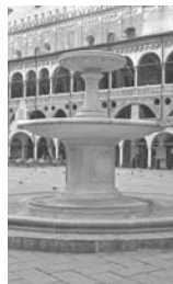
1. Padova Fountain, Piazza delle Erbe

This is the reason the illustrations chosen for this report have been inspired by the rich cultural wealth of our cities. They show the major fountains of each regional capital and of the head office cities of the Banche dei Territori. It is a tribute to Italian tradition and history. But it is also emblematic of the willingness to communicate and establish relationships that typifies the people of Intesa Sanpaolo and of the banks in the group.