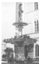
20. Catanzaro Fountain, Piazza Santa Caterina