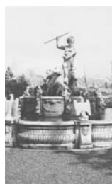
7. Genova Fontana di Nettuno, Palazzo Doria Pamphilj