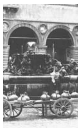
14. Pesaro Fountain, Piazza Maggiore