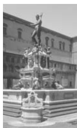
10. Bologna Fontana del Nettuno, Piazza Maggiore