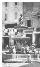
23. Ancona Fontana dei Cavalli, Piazza Roma